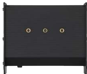
Three Threaded Mounting Holes (1 @ 1/4 - 20, 2 @ M5 on underside)