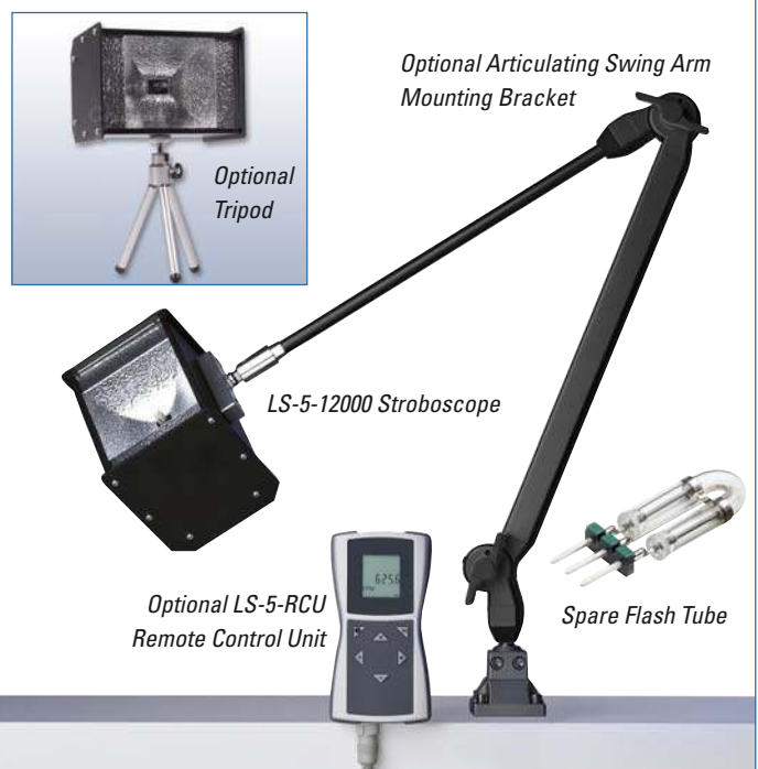
Optional Articulating Swing Arm Mounting Bracket