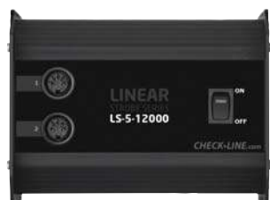
Control Panel with input/output ports